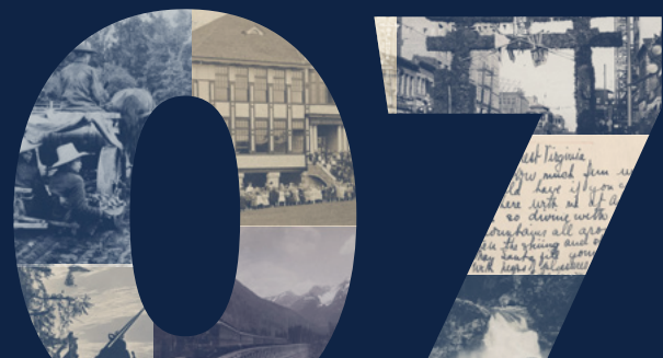
Top: Queen's Academy, Victoria. c.1905. Uno Langmann Family Collection of B.C. Photographs

UBC Library Rare Books and Special Collections launches a collaborative exhibition of photographs from the Uno Langmann Family Collection of British Columbia Photographs on display across UBC Library branches for the 2023 Fall term. The collection, donated by Uno and Dianne Langmann and Uno Langmann Limited, consists of more than 20,000 rare and unique early photographs from the 1850s to the 1970s.