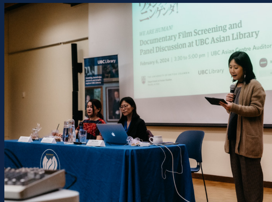
WE ARE HUMAN!: Documentary film screening and panel discussion

UBC Asian Library and the Department of Asian Studies host a film screening and panel discussion of Watashitachi wa Ningen da! ( We are Human! ). This award-winning film interrogates Japan's immigration policies and casts reflections on British Columbia's relationship with its migrant foreign workers.