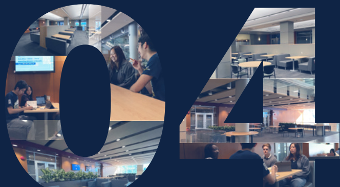
Level 2 Learning Concourse in the Irving K. Barber Learning Centre (IKBLC)

The Irving K. Barber Learning Centre opens their newly renovated Level 2 Learning Concourse. The space features upgraded seating, larger tables and plenty of power outlets for individual and group study. Students can choose from different types of seating whether they are studying alone, working on a group project or attending an online lecture.