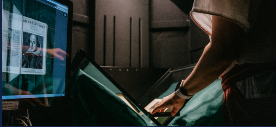
William Shakespeare's First Folio being digitized at UBC Library