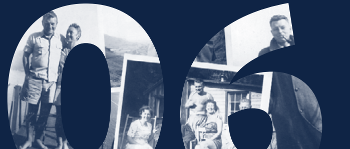
Lowry and Margerie on a street

UBC Library Rare Books and Special Collections announces the (re) launch of the landmark Malcolm Lowry Manuscripts Collection, one of UBC's oldest keystone research collections. As one of the largest single collections of Malcolm Lowry records worldwide, the collection spans more than six meters of textual records, over 1,000 photographs and a variety of audio-visual materials.