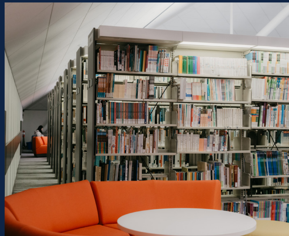
Upper floor of UBC Asian Library

UBC Asian Library benefits from two substantial renovation projects on both the upper and main floors of the branch, completed earlier this year. The reimagined space includes extensive improvements to seating and study spaces, much needed repairs, and an overhaul of the book collection stacks and displays.