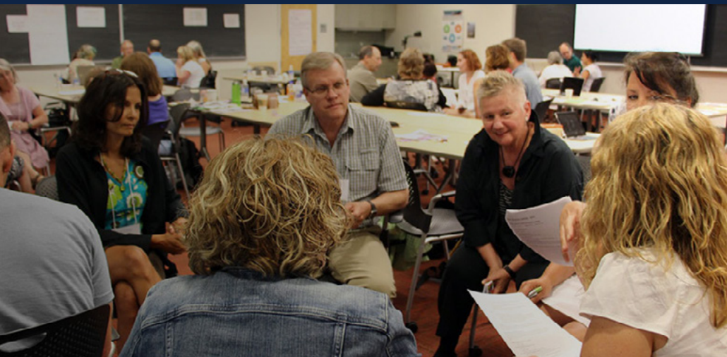
Networks of Inquiry and Indigenous Education (NOIE)

UBC Library's Irving K. Barber Learning Centre reflects on 10 years as a funding partner for the Networks of Inquiry and Indigenous Education (NOIE) and the critical role this organization fulfills at participating schools and school districts across British Columbia.