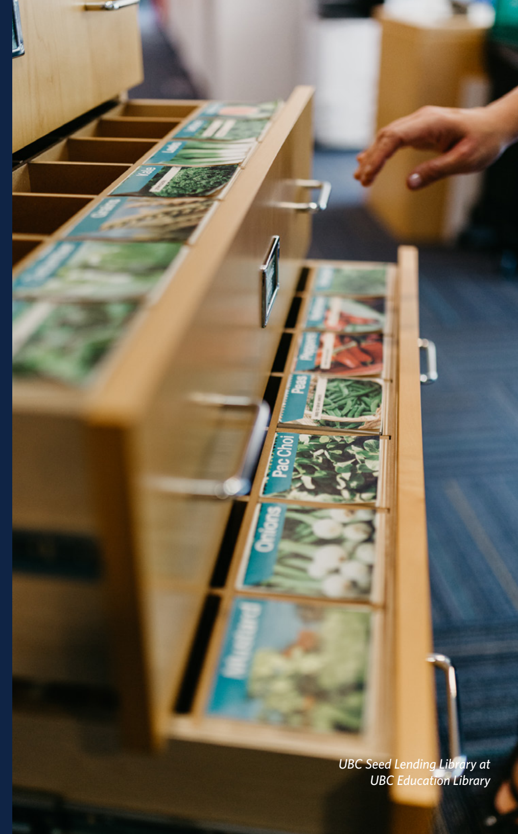
UBC Seed Lending Library at UBC Education Library