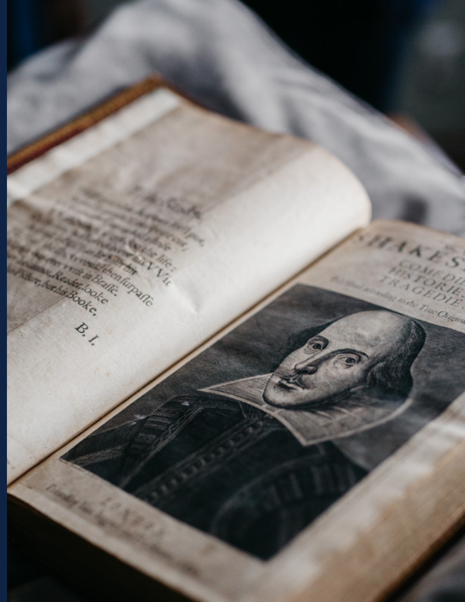
William Shakespeare's First Folio