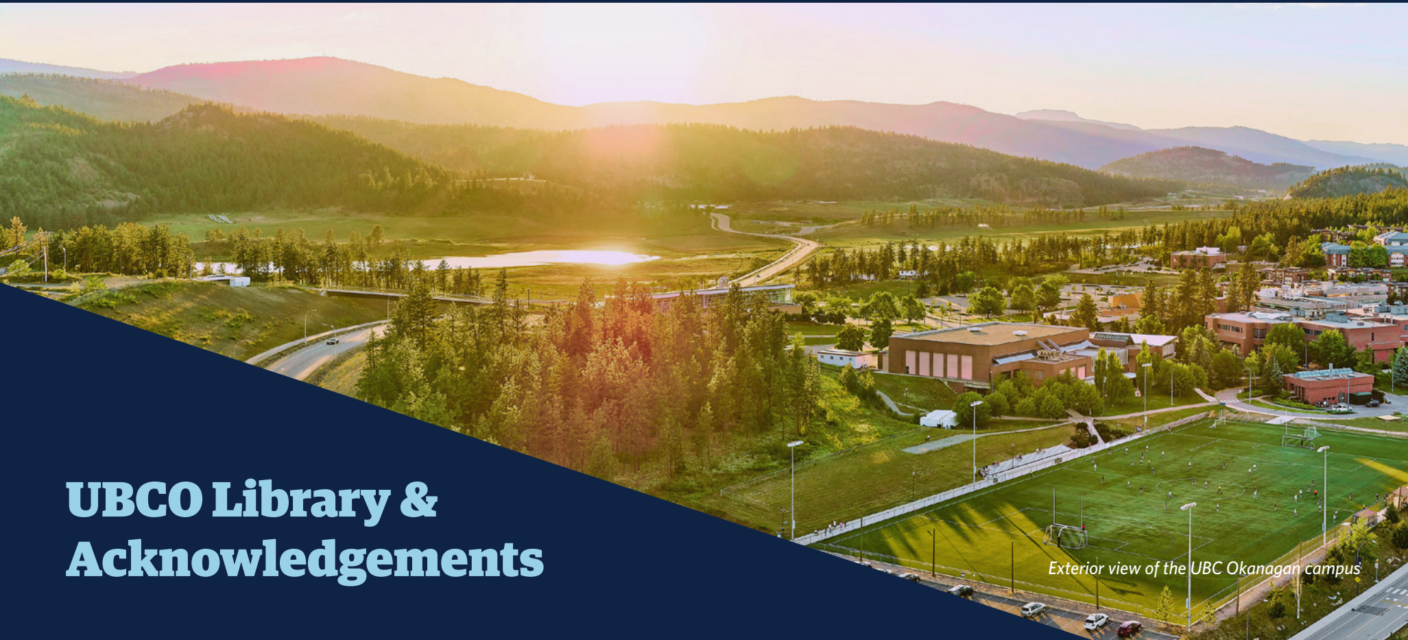
Exterior view of the UBC Okanagan campus